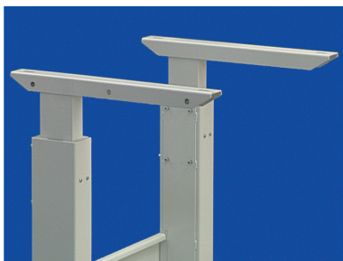
Table top support, not tiltable = basic version.