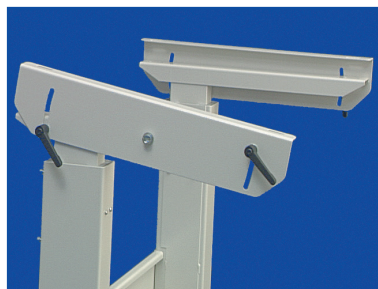
Table top support, tiltable = version „VT“ (can be retrofitted to basic version).

Request our CD ROM. It contains a lot of information about KESSLER as well as a detailed product catalog with all options.